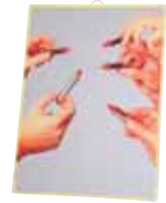
Lipsticks Mirror _17110 22,5 x 29,5 ≈ 8.6" x 11.6" ≈