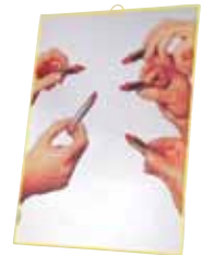
Lipsticks Mirror _17122 30 x 40 ≈ 11.8" x 15.7" ≈