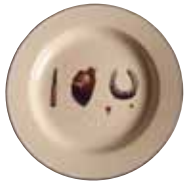
I love u