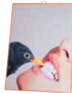
Crow Mirror _17112 22,5 x 29,5 ≈ 8.6" x 11.6" ≈