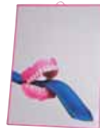
Denture Mirror _17111 22,5 x 29,5 ≈ 8.6" x 11.6" ≈