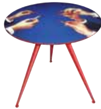
Lipsticks Large table _17151 ø cm. 70 h. 64,5 ≈ ø 27.5" x 25.4" ≈