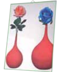
Flowers Mirror _17102 30 x 40 ≈ 11.8" x 15.7" ≈