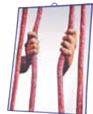
Sausages Mirror _17121 30 x 40 ≈ 11.8" x 15.7" ≈