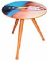
Crow Small table _17140 ø cm. 48 h. 49 ≈ ø 18.9" x 19.5" ≈