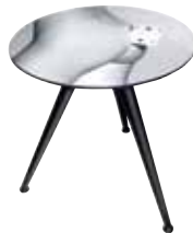
Two of spades Small table _17141 ø cm. 48 h. 49 ≈ ø 18.9" x 19.5" ≈