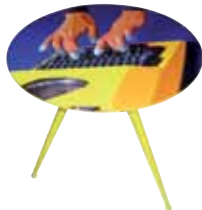
Typewriter Large table _17150 ø cm. 70 h. 64,5 ≈ ø 27.5" x 25.4" ≈